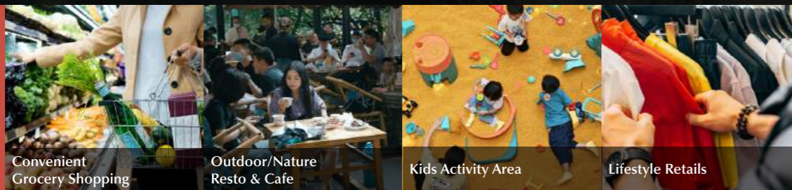
Convenient Grocery Shopping

Enriching life experience with good taste and convenient shopping.